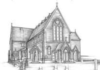
ST BENEDICT'S 1 ST BENEDICT'S ST NEWTON, AUCKLAND