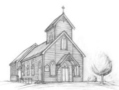
ST JOHN THE BAPTIST 244 PARNELL ROAD PARNELL, AUCKLAND